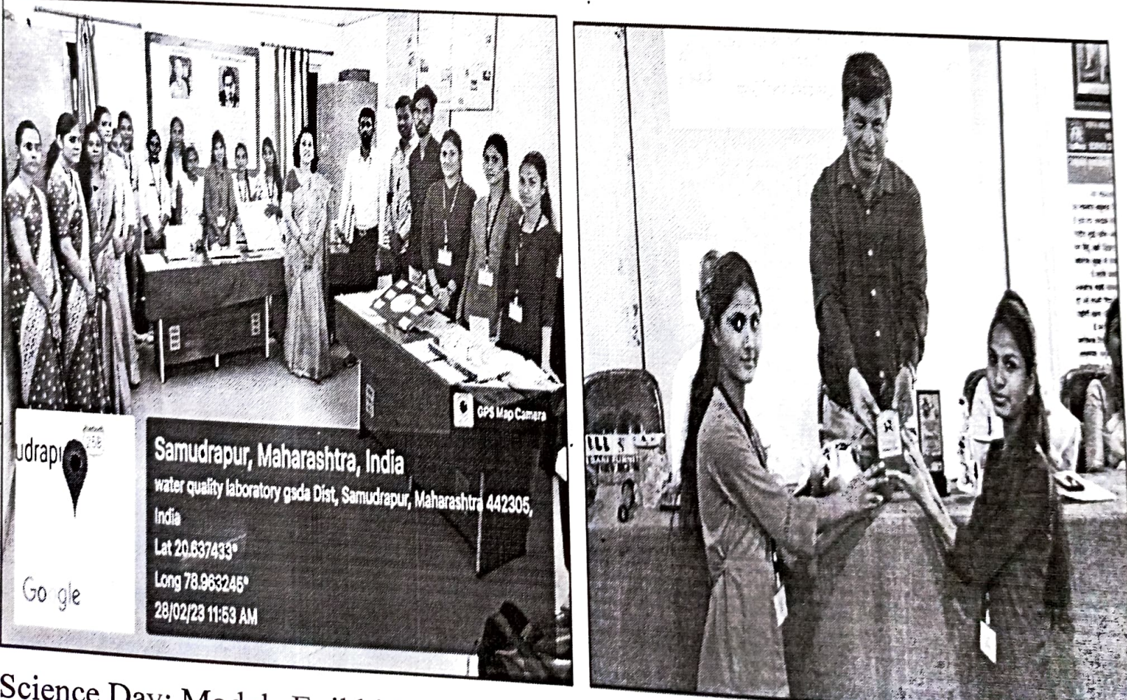
Science Day: Models Exibition 28, 02