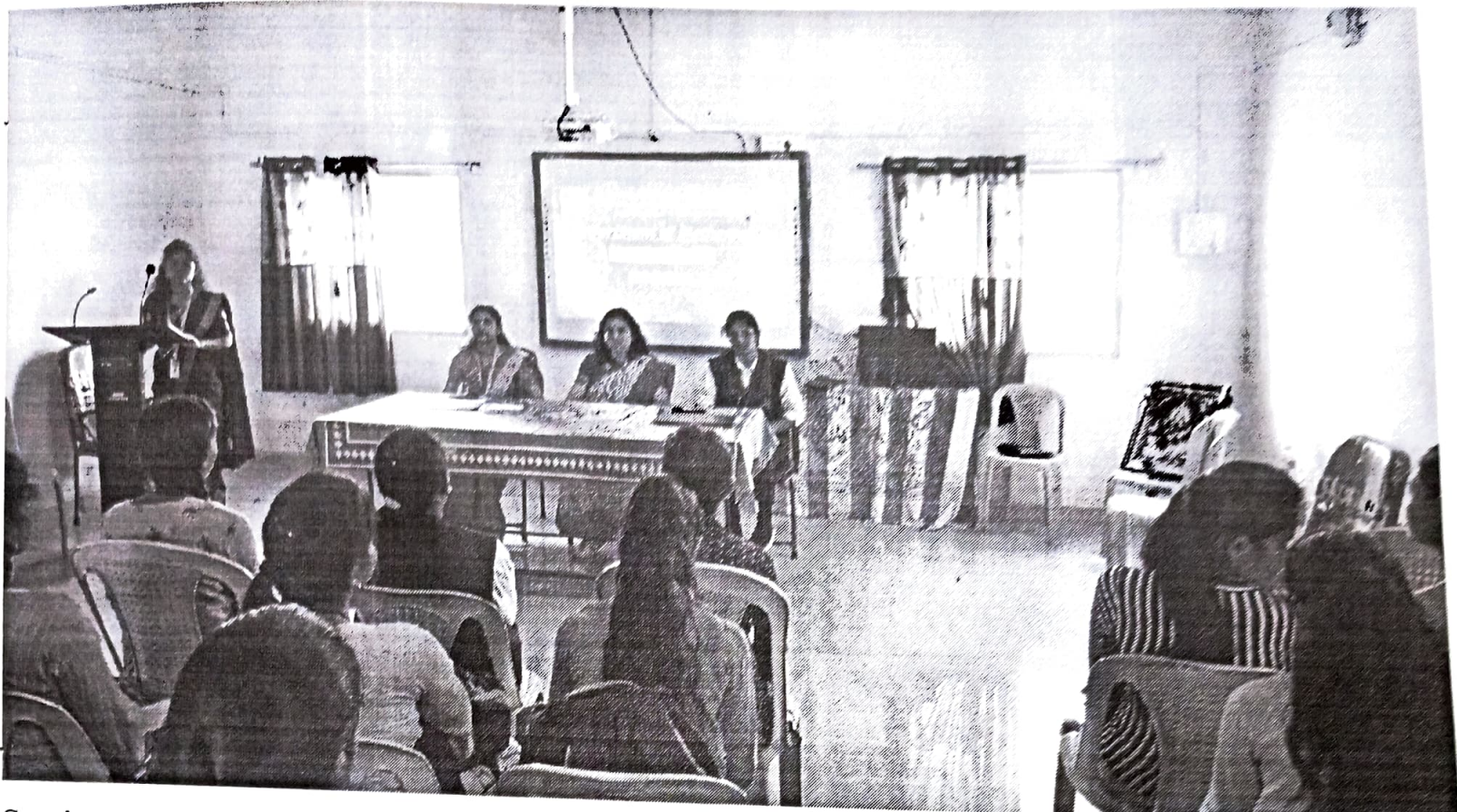
Seminar activity on dated 17/10/2022