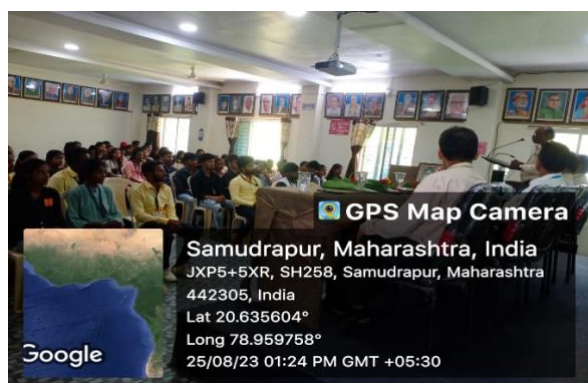
Attended Students of Programme