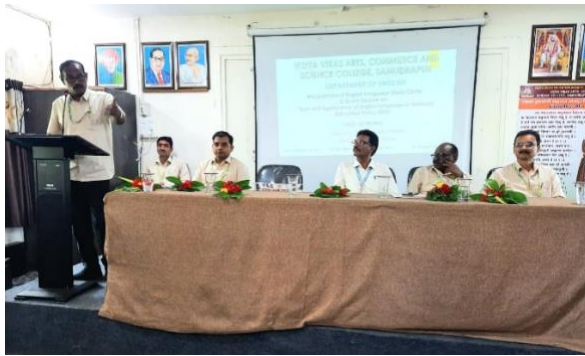
Chairman of the Programme