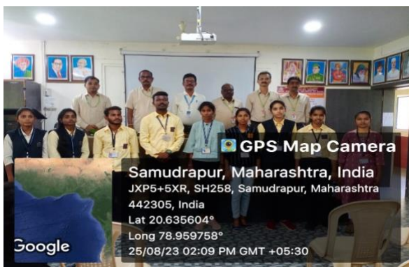
Study Circle Pannel Chairman & other Members