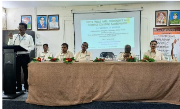
Guest Speaker of Topic "National Educational Policy 2020"