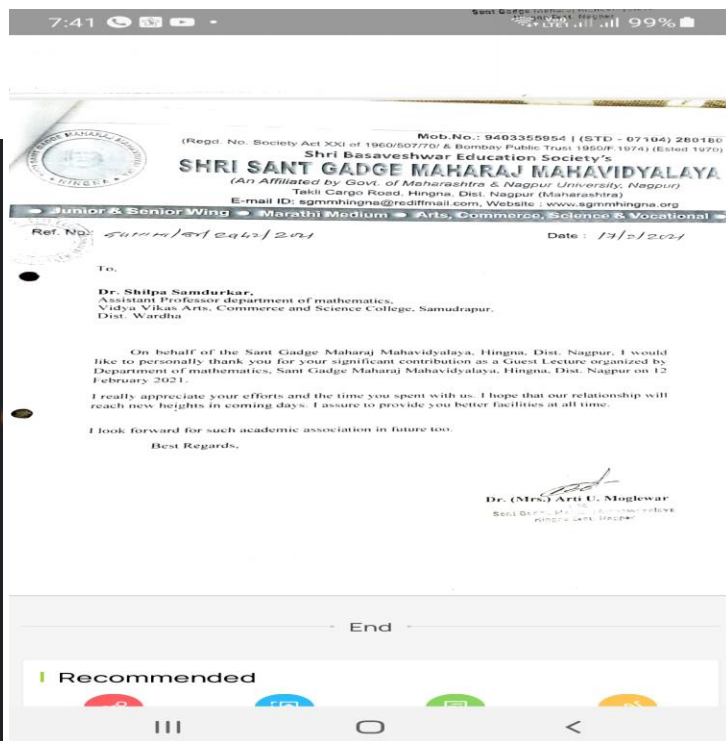
Guest Lecture delivered