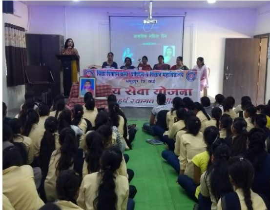
Celebration of 8 th March : Women Day